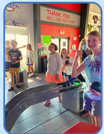
Students in grades 6-8th, attended their gradeband team building day at Badger Sports Park at the start of the school year.