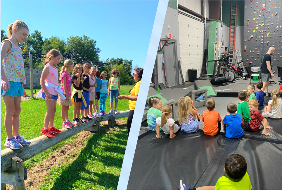
Students in grades 2-5, attended their gradeband team building day at TNT Adventure Course. (Pictured Left) Students in grades K-1, attended their gradeband team building day at Warrior Jungle (Pictured Right)