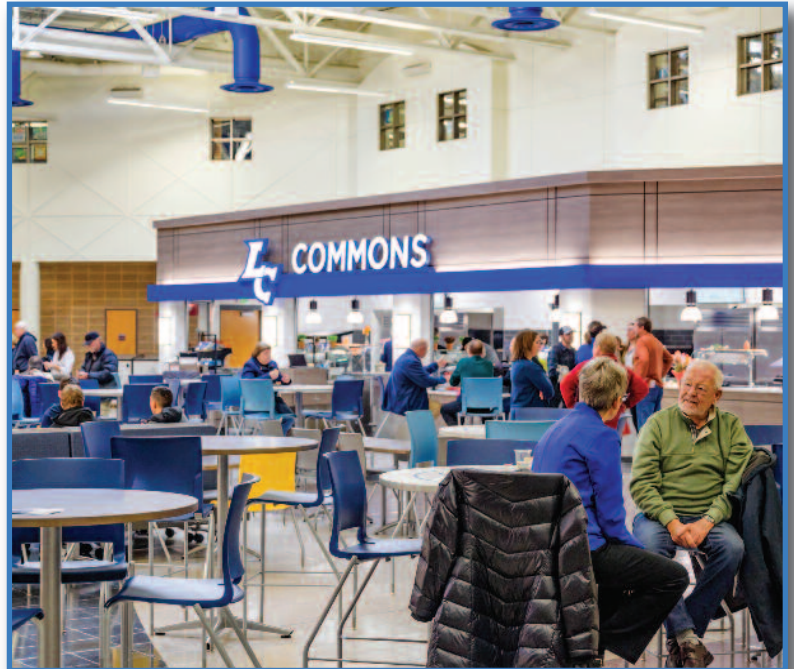
Renovated commons and food service area