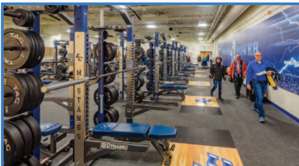
Renovated fitness room