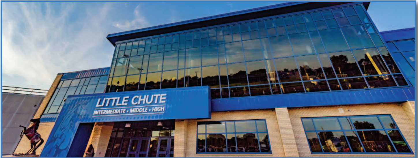
New front entrance to the Intermediate/Middle/High School

In April 2017, a referendum was passed to renovate the existing Intermediate/Middle/High School. The finished building is outstanding and provides a school where all students will thrive mentally, emotionally, and physically.