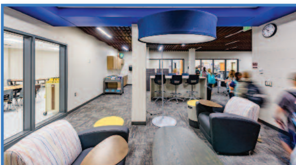
Student collaboration space