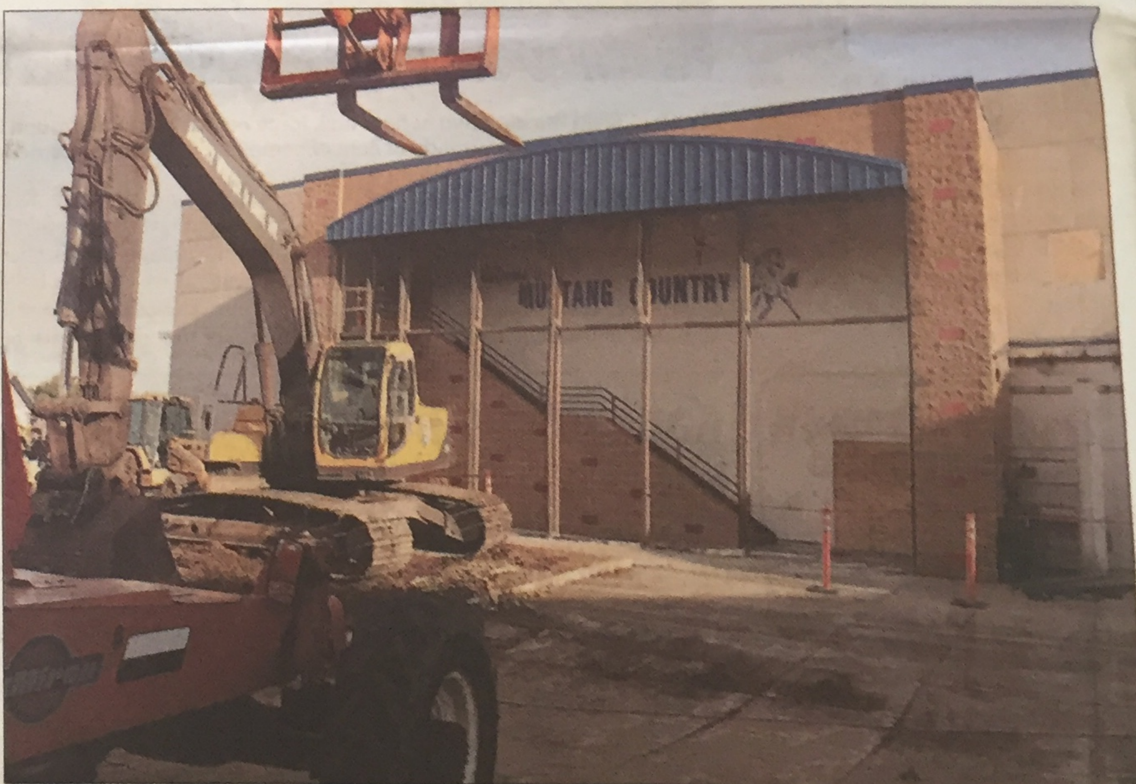
Exterior windows have been removed to get ready for the $17.7 million project to enlarge, revamp, and remodel the Little Chute high/middle/intermediate school complex.

Find us on Facebook www.facebook.com/The-Carpenter-tle-Chute - Visit our facebook for additional Christmas specials!